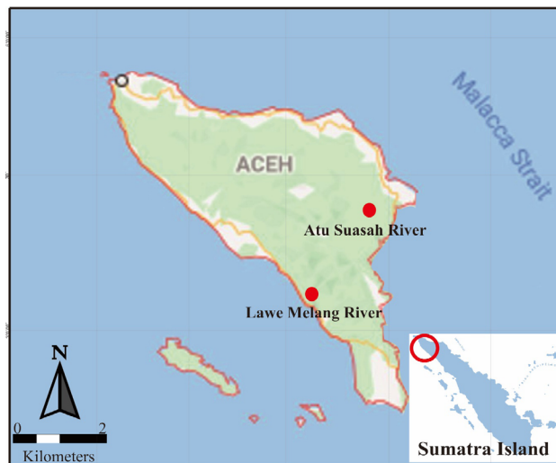
Fig. 1. Map of Aceh Province in Indonesia showing the study sites.

The study was conducted from July to December 2019 in the Atu Suasah and Lawe Melang Rivers, Aceh Province, Indonesia (Fig. 1).