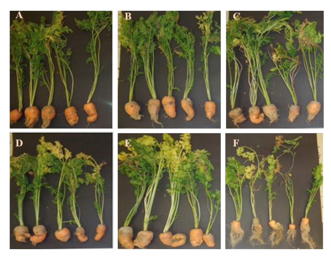
Fig. 2. Improvement of plant growth parameters and reduction of root galls and egg masses in carrots after treatments with nematophagous fungi; (A) A. oligospora , (B) L. muscarium , (C) D. oviparasitica , (D) C. rosea , (E) S. rugosoannulata , as compared to control (F) M. hapla eggs