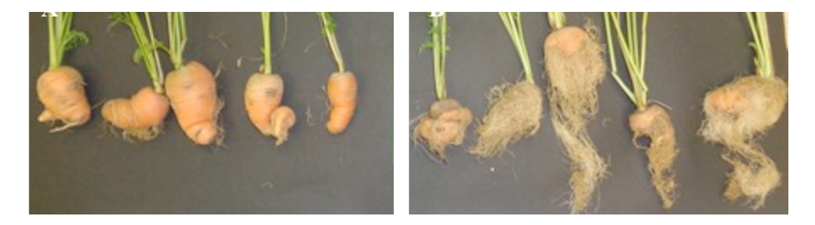
Fig. 3. Improvement of roots in carrot plants after treatment of fungus, L. muscarium (A) as compared to control (B), M. hapla (J2)