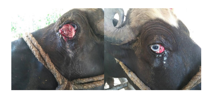
Fig. 1. Cauliflower like growth at right and left eye.

Laboratories, Pakistan, Ltd.) for Peterson eye nerve block technique. Eye nerve block was performed with spinal needle (18 gauge) by using xylocaine (Barrete pharma, Germany), (20 ml for retro palpebral nerve block and 5 ml for auricopalpebral nerve block). After positioning the animal in standing position, aseptically prepare the eye for aseptic surgery using one percent boric acid solution. Exposed mass then removed after dissection with the margin of 1 cm. Diffuse bleeding were controlled by using adrenaline gauges applied at the excision site. After excision of the tumorous mass, remaining surface was cauterized by using swab of AgNo<sub>2</sub>. Eight animals having lesions on limbus and cornea were treated by performing enucleation in 6 and exenteration in 2, respectively. Antibiotic therapy (penicillin-streptomycin, 20,000 IU/ kg, IM, twice a day), were administered for 7 days after surgery. Post operatively, all animals were followed by communication with clients on phone calls and on routine daily visits up to seven days. There was on reoccurrence of lesions were observed in all cases.