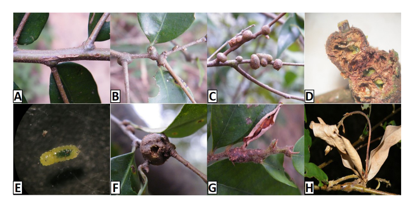
Fig. 2. Formation of galls induced by the Contarinia sp. on C. hystrix stem and leafstalk, and the morphological characteristics of gall midge larvae.