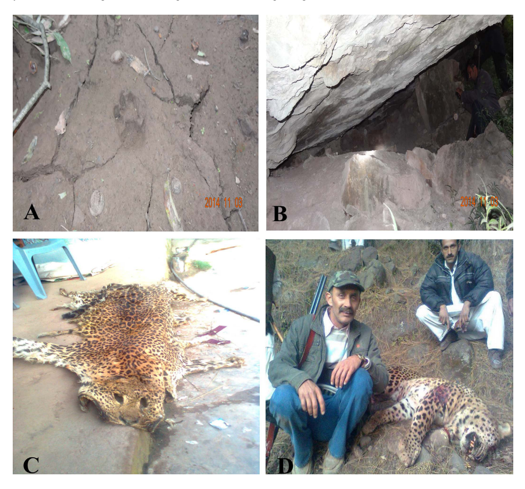
Fig. 2. Pug mark of common leopard at Seyo Wala Pahar Hill-I (A), cave of common leopard at Seyo Wala Pahar Hill-I (B), skin of common leopard recovered from the custody of local hunters at Kali Kassi (C), killed common leopard found at Seyo Wala Pahar Hill-I (D).