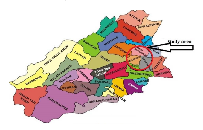
Fig. 1. Map of the study area.

Three districts of the Punjab province Gujranwala, Hafizabad and Mandi-Bhaudin (Fig. 1) were explored to find out species of bats belonging to the genus Pipistrellus . Punjab is the most populated province of the country and the districts comprising study area constitute the core rice producing belt, hence the natural ecosystems have been replaced by the agro-ecosystems to fulfill the food and shelter requirements of increasing human population. These districts lie about 200 m above sea, average annual rainfall is about 950 mm but the rains are more frequent during monsoon. The temperature varies from 4°C during winter to above 40°C during summer (Qadir et al. , 2008; Ullah et al. , 2009).