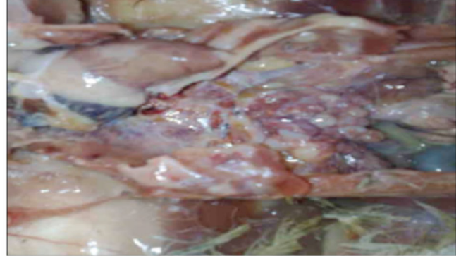
Supplementary Fig. S1. Clinical symptoms and postmortem lesions. Poultry and pheasantry birds showing clinical signs or postmortem lesion of the resected organs of CRD suspected birds.