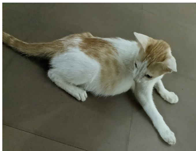
Figure 3: Cat affected with feline infectious peritonitis (FIP) at Care and Cure Veterinary Clinic in Dhaka.

(Benetka et al. , 2004; Riemer et al. , 2016; Worthing et al. , 2012) showed that males had significations relationships.