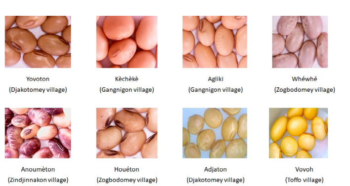
Figure 1: Seeds of soybean cultivars along with their collection site names.

Eight soybean varieties presenting different morphological characteristics grown in the south and centre Benin were used for experiments (Loko et al., 2021). The soybean seeds were obtained from farmers in eight villages in the southern Benin (Figure 1). The soybean seeds were sorted using a binocular microscope to ensure that they were not damaged or infested. Sterilization of soybean seeds was done by drying them in an oven at a temperature of 30°C for 24 h (Msiska et al., 2018). Healthy seeds were conditioned at room temperature (25\pm2^{\circ}C) and relative humidity of 65±5% in the laboratory for 2 weeks.