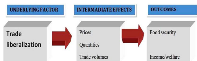
Figure 2: Transmission mechanisms between trade liberalization and food security.

The figure clearly shows that any reform or external shock will indirectly affect the welfare of the society through some intermediate factors. Trade liberalization influences domestic prices by delivering incentives to producers and consumers. As a response to the changes in price level and access to external markets; the altered quantities are produced. It depends on the degree of market admittance, market assimilation and the degree of access to marketed assets. Trade liberalization on the one hand contributes to domestic stuffs and on the other hand it contributes to international trade volume. Finally,